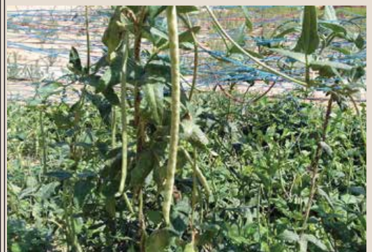
Baniyas Organic Farming – An Initiative By ADMTYS