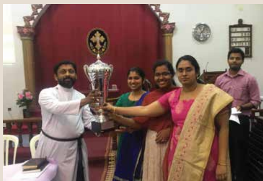
UAE Interchurch Bible Quiz Competition 1 st Prize Winners