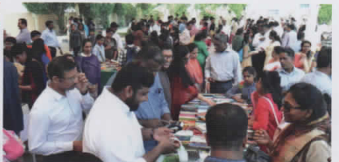
International Woman's Day Program