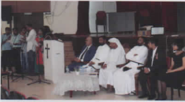
Annual Joint Prayer Meeting