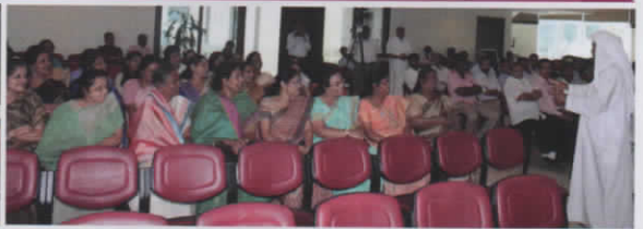
CCC - Safe Physical Activity Session